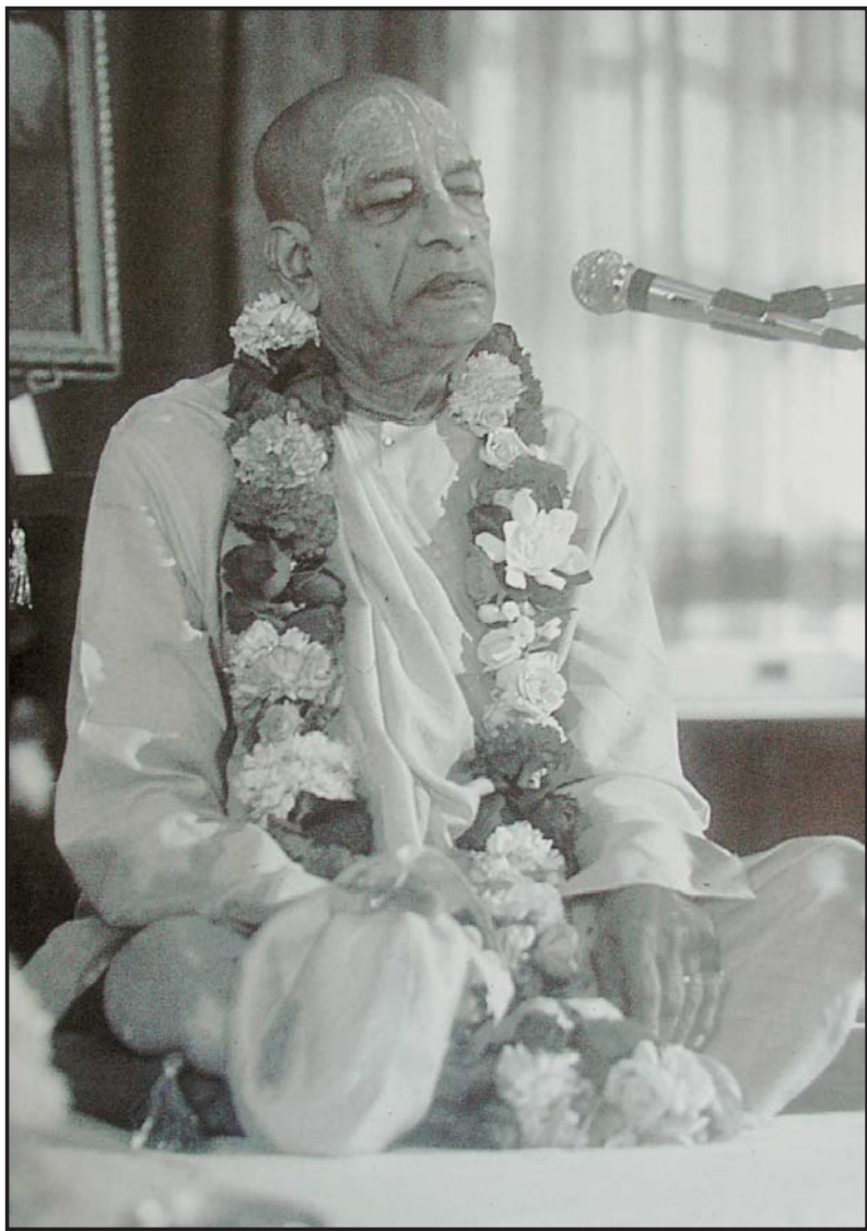
Śrī Śrīmad Bhaktivedānta Swami Prabhupāda