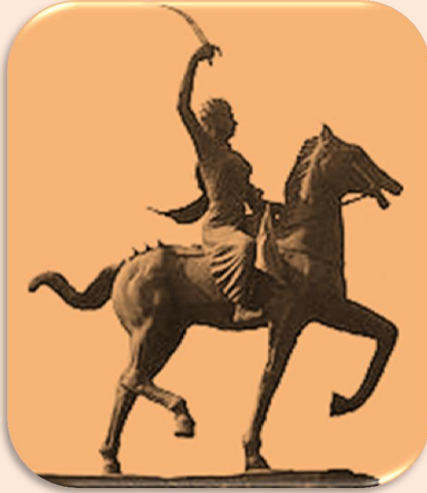
Statue at Agra

बुंदेले हरबोलों के मुँह हमने सुनी कहानी थी, खूब लड़ी मर्दानी वह तो झाँसी वाली रानी थी।। सिंहासन हिल उठे राजवंशों ने भृकुटी तानी थी, बूढ़े भारत में भी आई फिर से नयी जवानी थी, गुमी हुई आज़ादी की कीमत सबने पहचानी थी, दूर फिरंगी को करने की सबने मन में ठानी थी।।