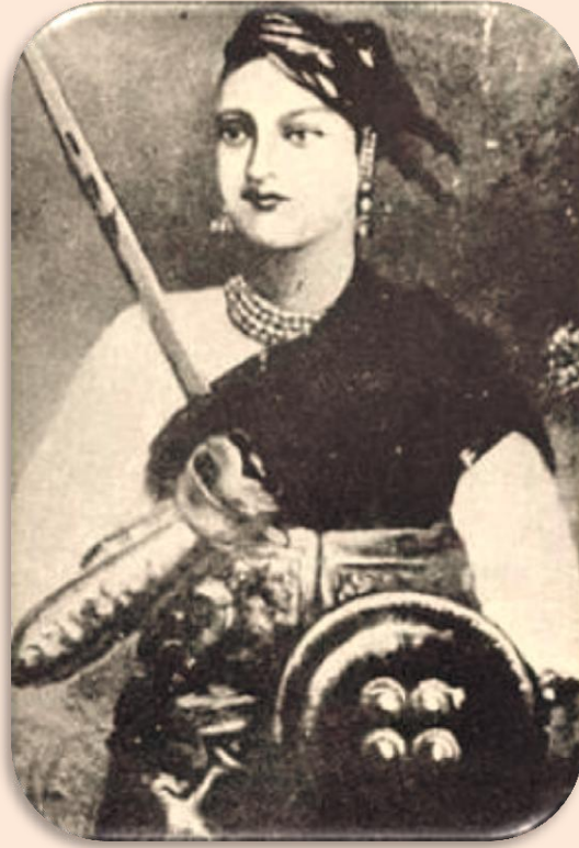
Queen of Jhansi in warrior costume

बुंदेले हरबोलों के मुँह हमने सुनी कहानी थी, खूब लड़ी मर्दानी वह तो झाँसी वाली रानी थी।।