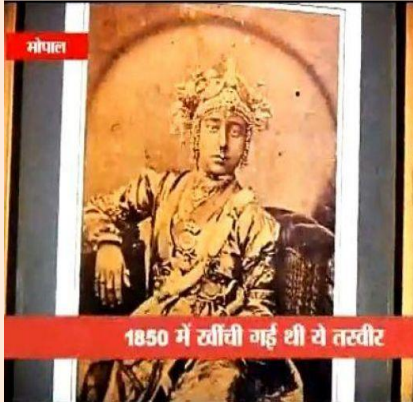
Actual Photograph of Maharani Lakshmi Bai

In the year 1853, Gangadhar Rao fell sick and became very weak. So, the couple decided to adopt a child. To ensure that the British do not raise an issue over the adoption, Lakshmibai got this adoption witnessed by the local British representatives. On 21 st November 1853, Maharaja Gangadhar Rao died.